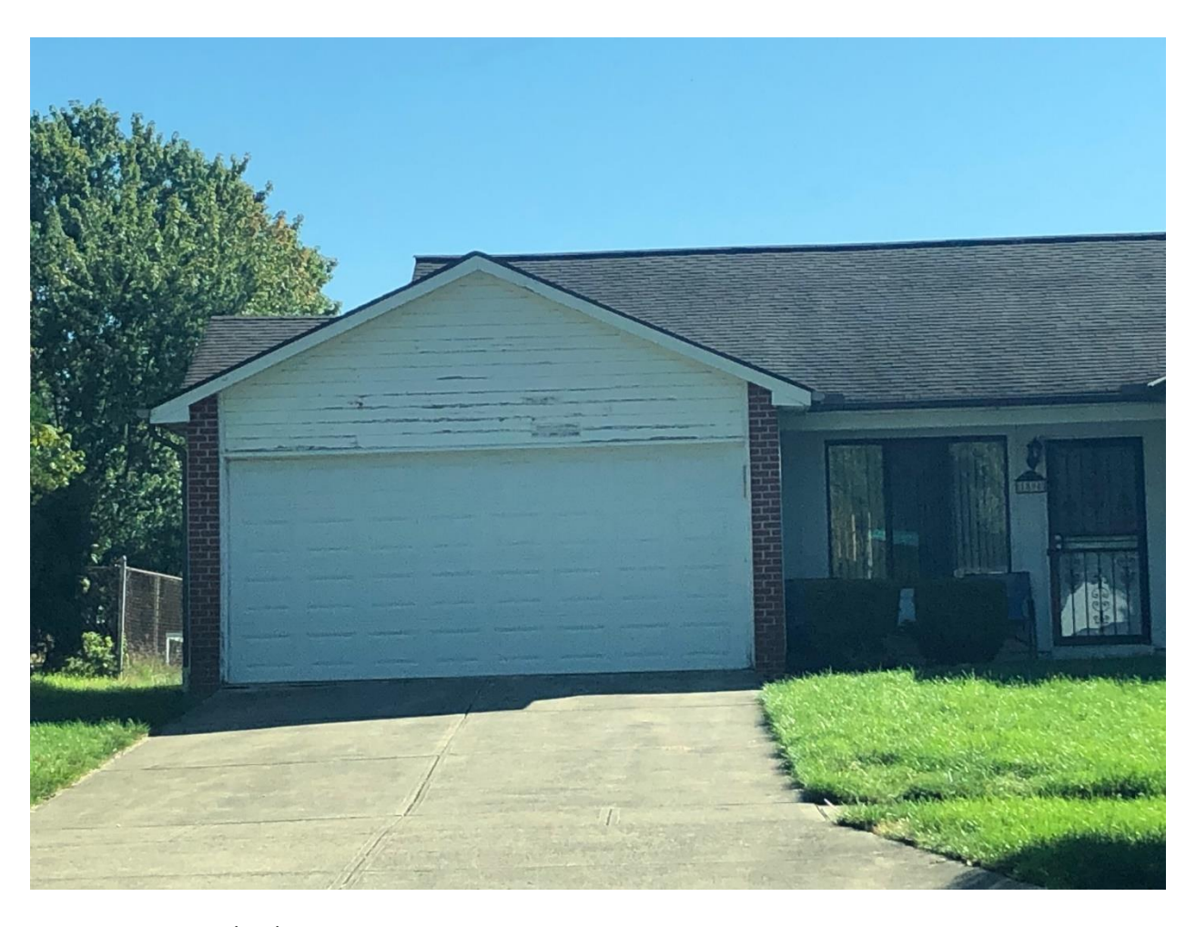
1894 Mountain Oak Rd.