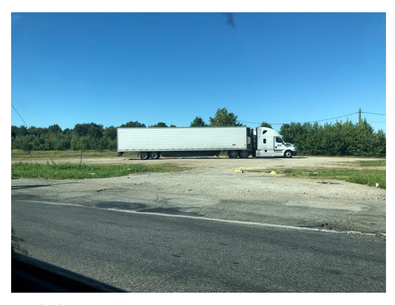
3101 Agler Rd.