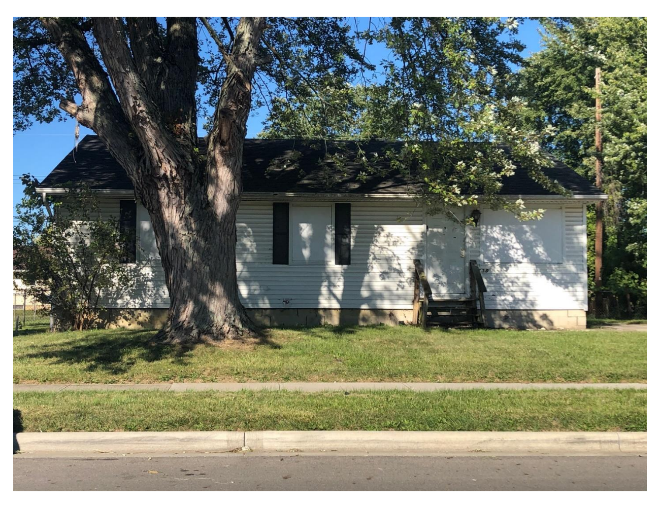
2739 Gatewood Rd.