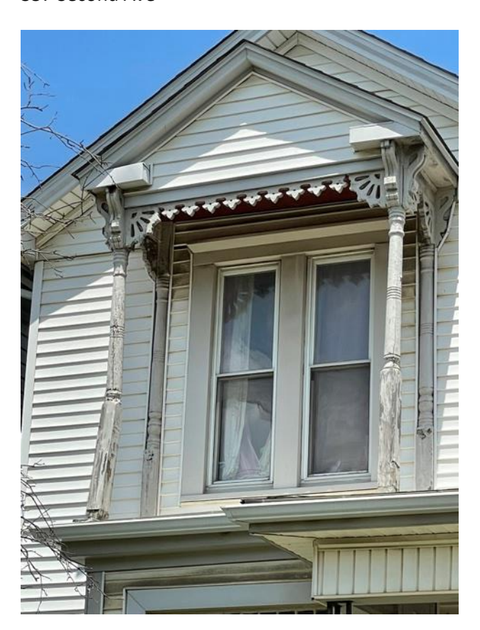
474 Second Ave