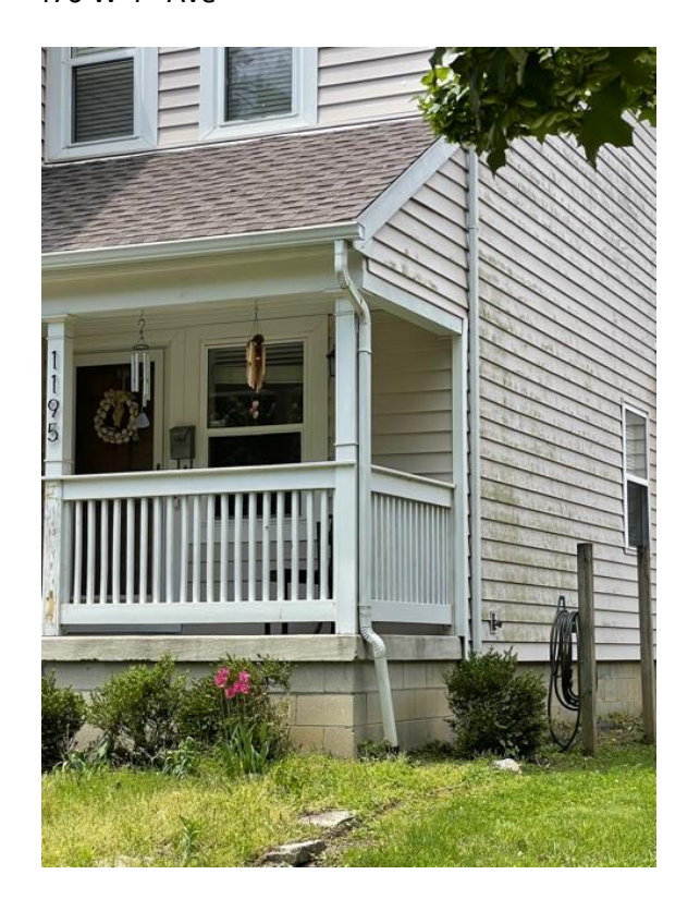
1195 Michigan Ave