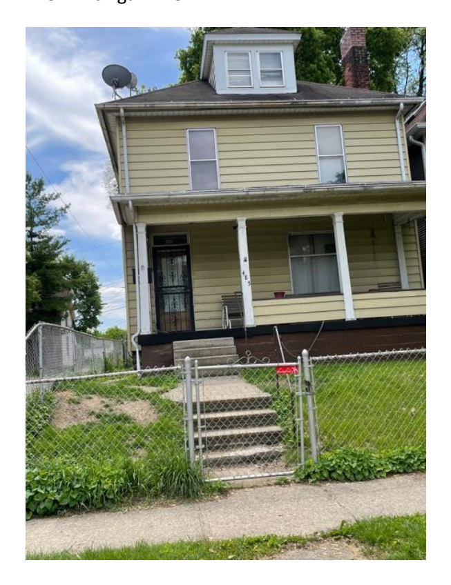
485 W 4<sup>th</sup> Ave.