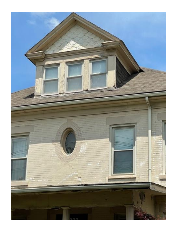
332 Buttles Ave.