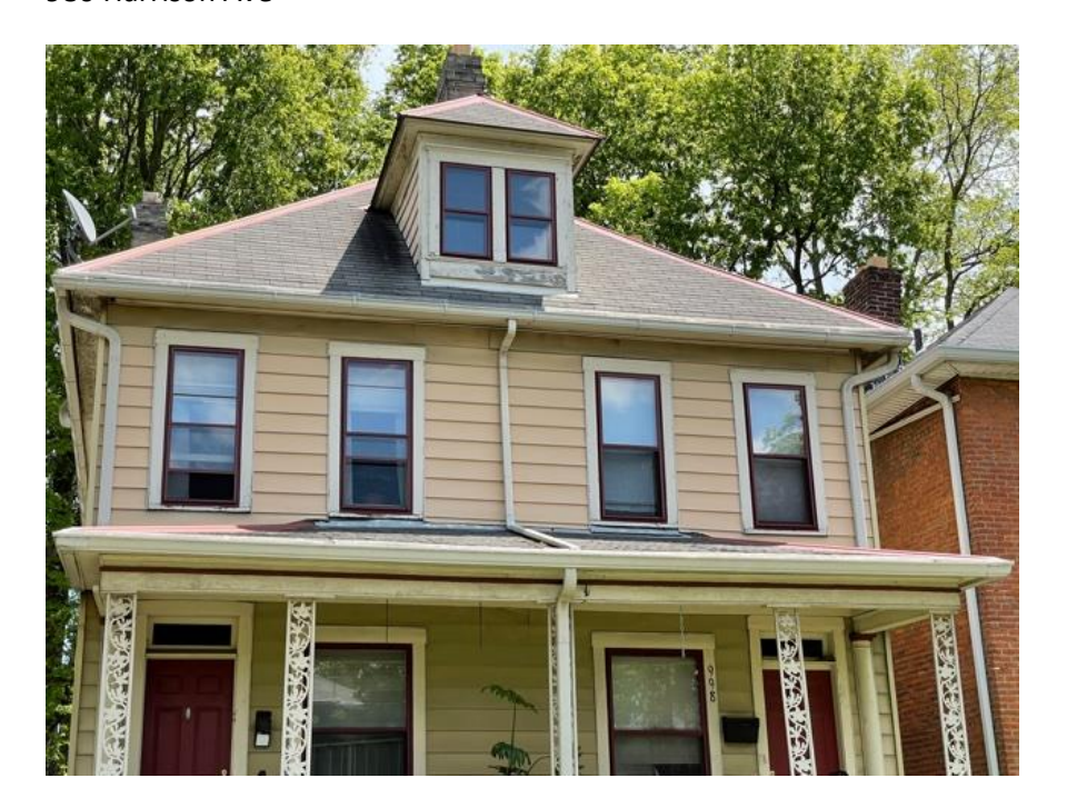
998 Harrison Ave