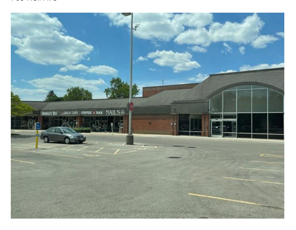
777 Neil Ave