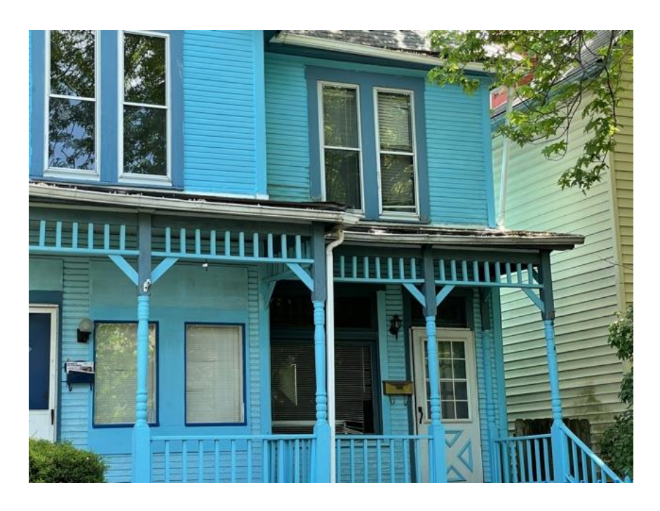
980 Harrison Ave