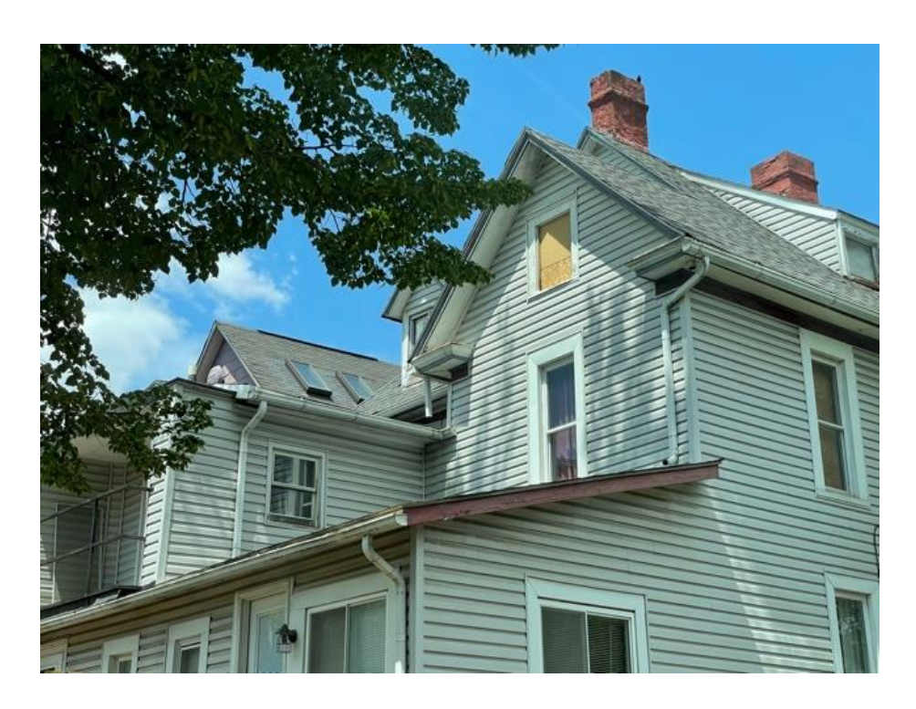
357 Second Ave