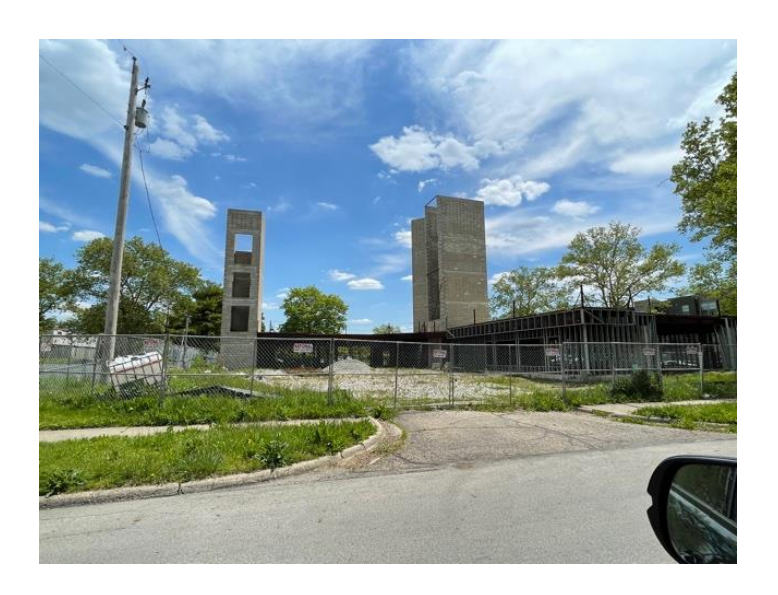
840 Michigan Ave