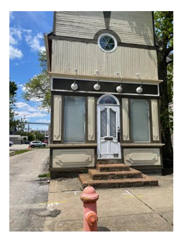
1281 Michigan Ave.