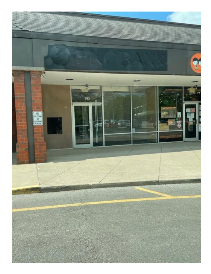
763 Neil Ave