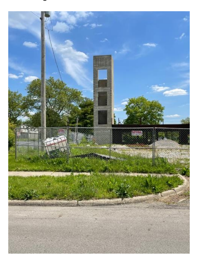
840 Michigan Ave