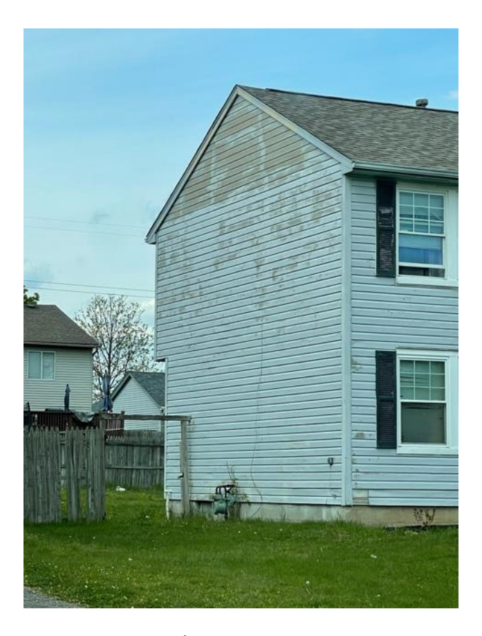
2976 Bretton Woods