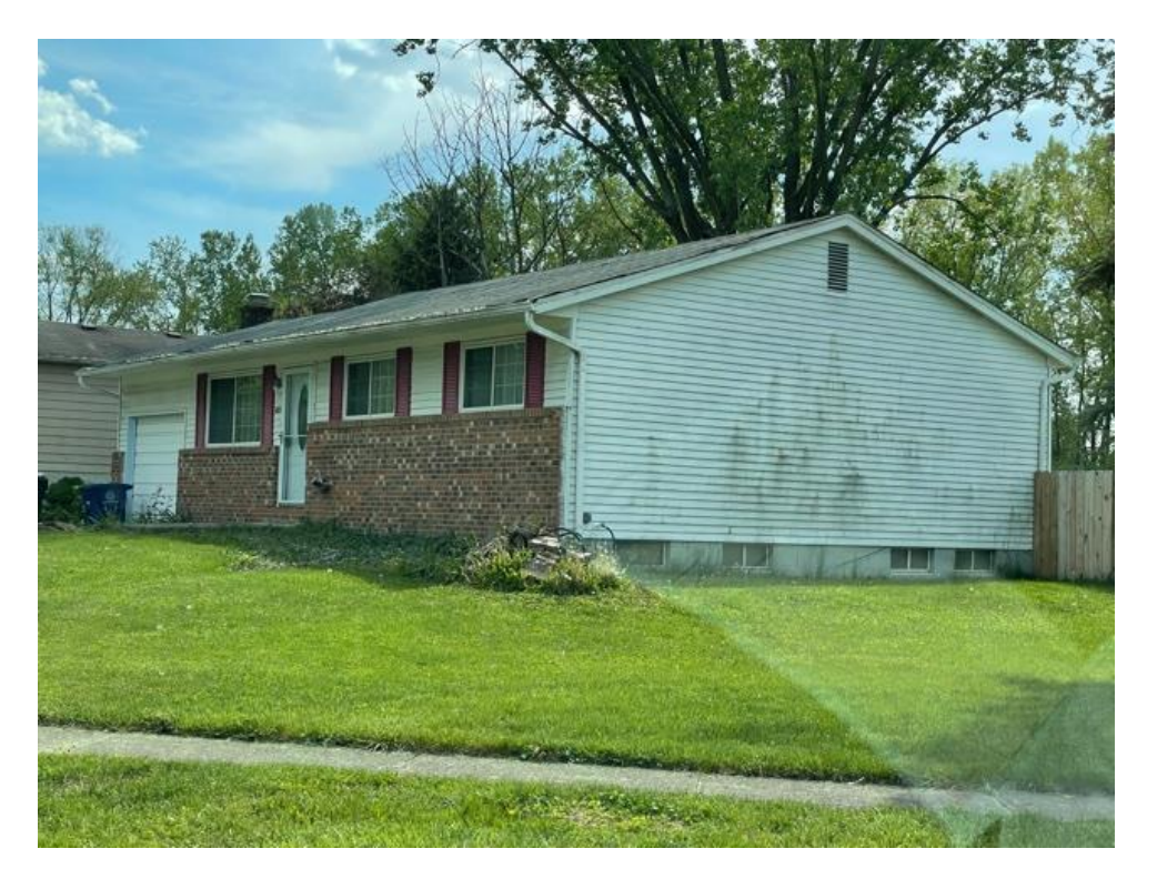
4803 Bradbury Ct