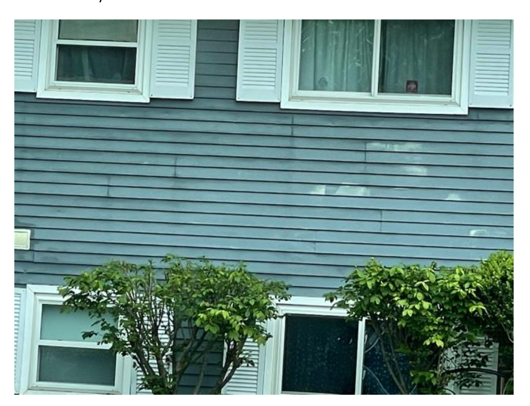
2822 Tristram Place