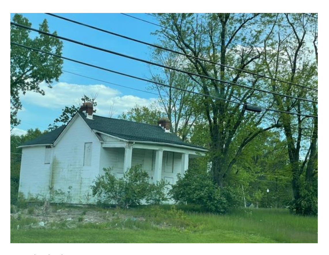
4788 Cleveland Ave