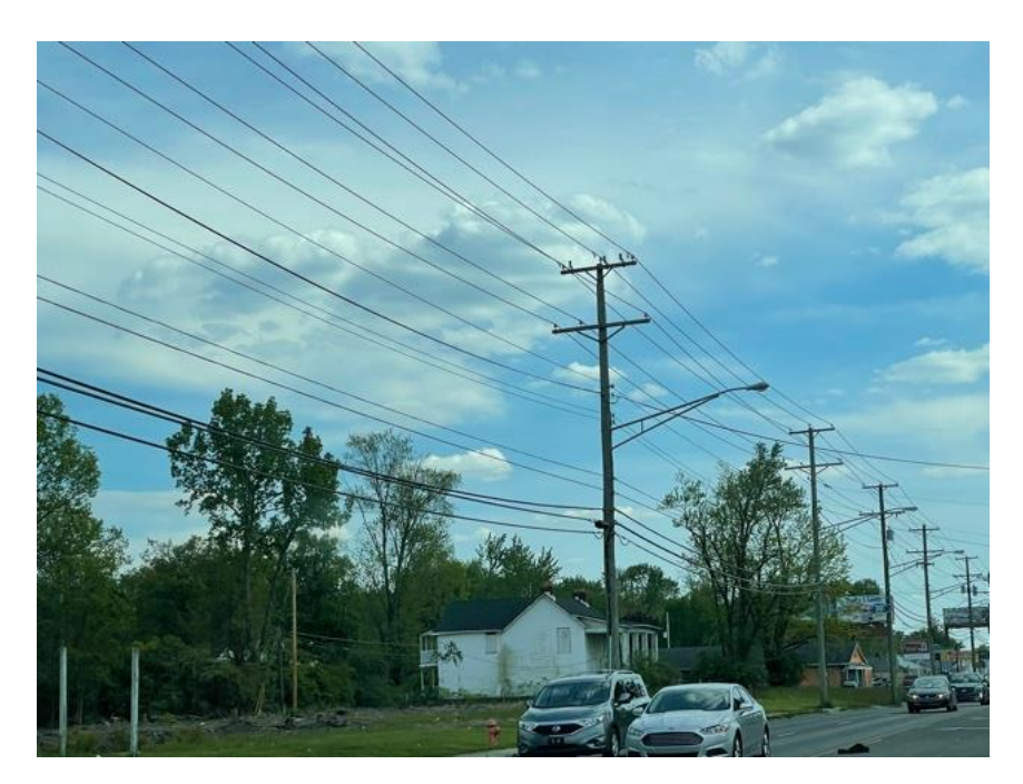
4788 Cleveland Ave